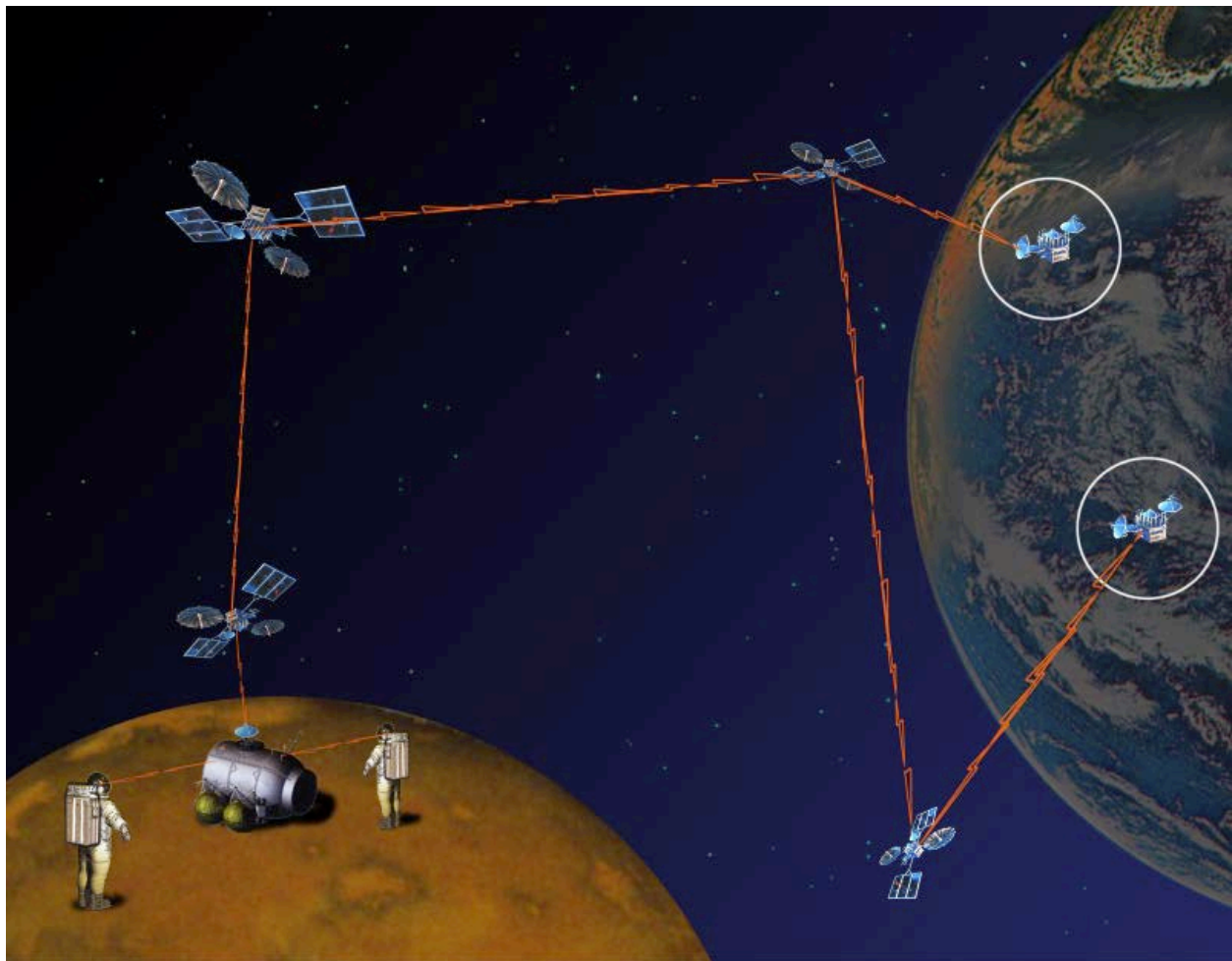
Figure 3. Multiple sources of video distributed across multiple satellites or “nodes”, with high potential for disruption.

The most complex aspect to deploying robust motion imagery systems on future exploration missions will be routing and distributing the streams of data. Imagine a mission to an asteroid, the Moon, or Mars, where multiple spacewalking astronauts are deployed. Each astronaut might have a helmet-mounted camera. In addition, cameras mounted on the spacecraft or deployed on rovers or stands might serve as third person monitors of the activity. If the mission is international, space operations centers around the globe will be monitoring the video feeds (See figure 3). If the mission is near-Earth, the feeds will be monitored in real-time, with very low latency from actual time of events. If the mission is at an asteroid or on Mars, the video may be arriving tens of minutes behind actual time.